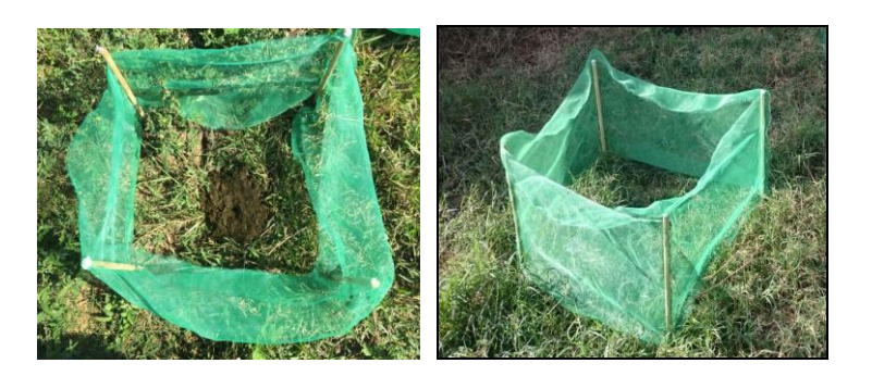
Figure.1 Stool from horses on pasture

Studies have shown that nematophagous fungi do not cause imbalance in the environment. Yeates et al. (1997), offered blocks of the predator nematophagous fungus D. flagrans to sheep and treated another group with anthelmintic to check the effect of soil nematodes. The results showed that there were no significant changes in the nematode fauna in this environment. Likewise, Braga et al. (2009) conducted a pellets path test containing this fungus in